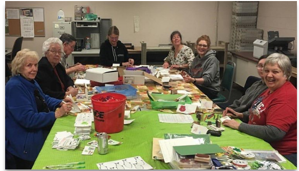
Making blessing cards for visitors.